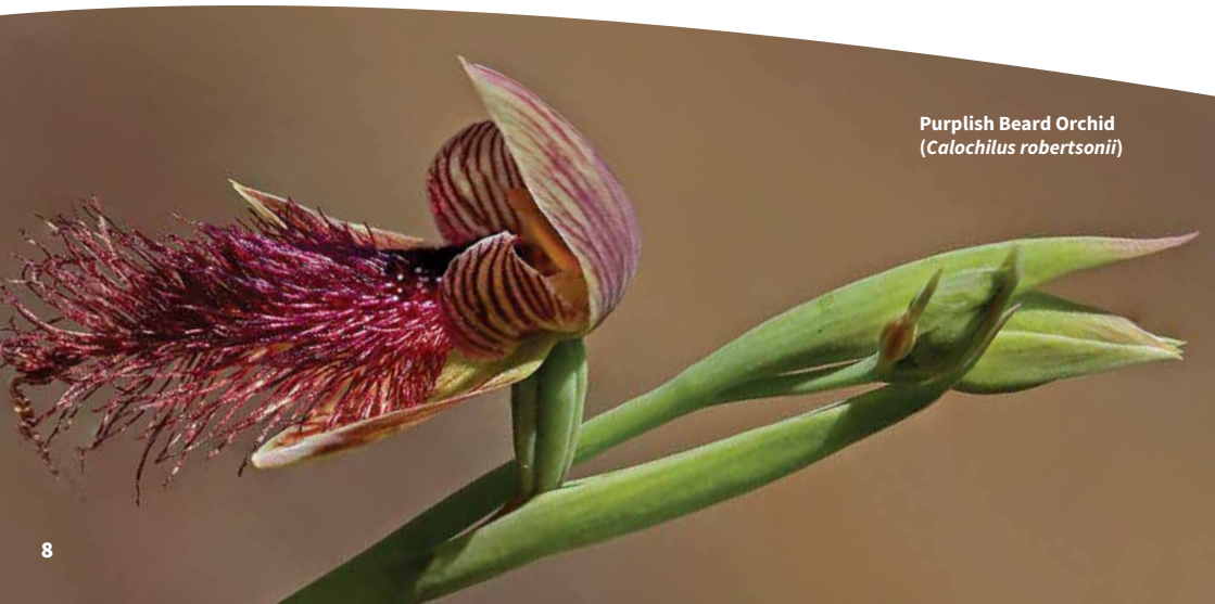
Purplish Beard Orchid ( Calochilus robertsonii )